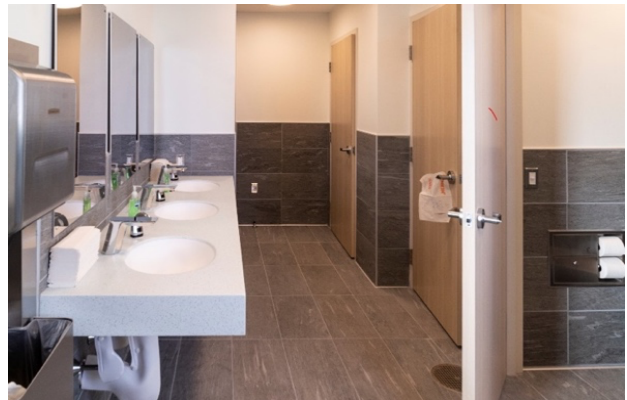
Bathroom after renovation.

Through the design process, we ensured that community feedback was incorporated. We held many informal design reviews and developed several iterations of the design. We eventually landed on a design for a bathroom that we were confident most people would feel comfortable using. We say “most” because, while we strove to meet everyone’s needs, we know there are people who will never feel comfortable using a shared space. Even as we were given approval to move forward into construction, we hoped that sharing sinks would not be such a big culture change for employees that the pilot would fail. Thankfully, it did not.