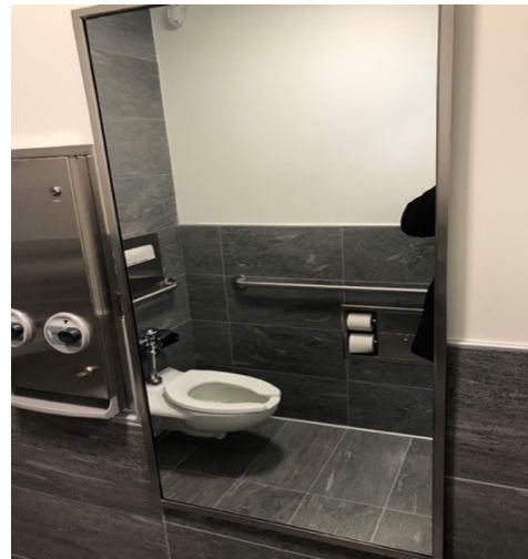
Single-use stall with mirror and menstrual product dispenser.