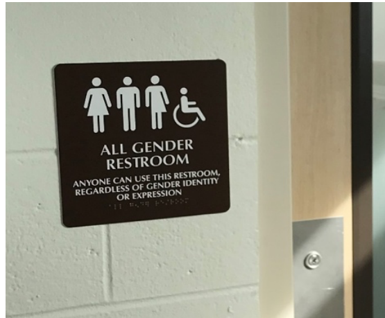
Inclusive signage outside bathroom entrance.