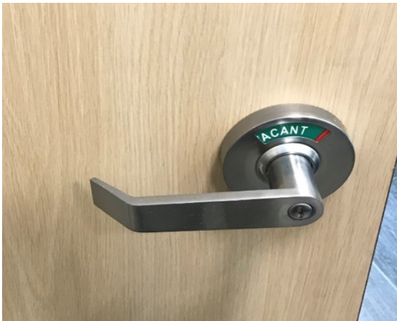
Stall door with occupancy indicator.