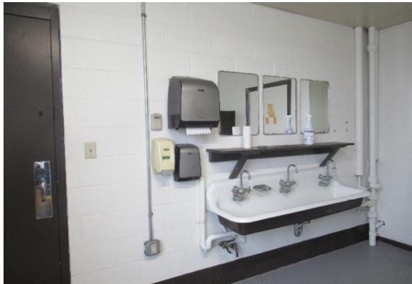
Bathroom before renovation.

Like many institutions, MIT LL has satellite locations. Our ideal goal was to identify a bathroom at our main campus complex that needed to be upgraded and had the appropriate spatial requirements to convert to an AGB. Unfortunately, a space was not identified at the main complex first, but at a satellite building site. At the satellite building site, existing gendered bathrooms had never been renovated, did not meet current code, and would have to be completely gutted and replumbed in order to renovate. This presented a prime opportunity to fully renovate a space that already needed it, test our design requirements, and develop a prototype that could be used in future locations at the main campus complex. Through community feedback, this prototype could help us tweak future designs if needed and provide data to help justify additional AGBs in the main complex. The bathroom renovation is pictured below: