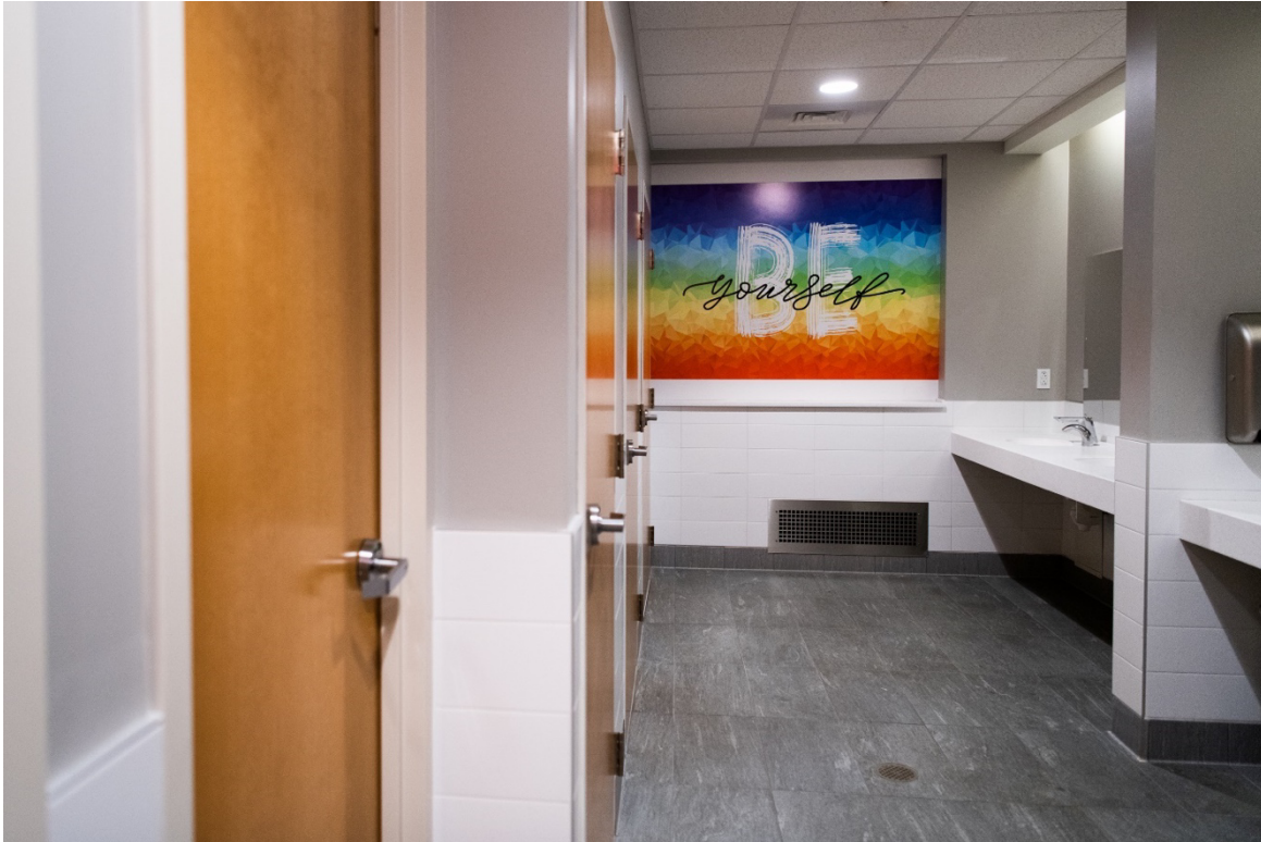
All-Gender Bathroom at MIT Lincoln Laboratory.

This white paper aims to share knowledge and experience about the process of building All-Gender Bathrooms (AGBs) at MIT Lincoln Laboratory (MIT LL), including the cultural change management process, community-based planning and design process, and design standards for All-Gender Bathrooms. MIT LL is a Federally Funded Research and Development Center (FFRDC*) applying advanced technologies in support of national security. Located in Lexington, Massachusetts on Hanscom Air Force Base property, MIT LL reports to the Massachusetts Institute of Technology (MIT, MIT Campus) Office of the President. MIT LL is managed by MIT on behalf of the Department of Defense.